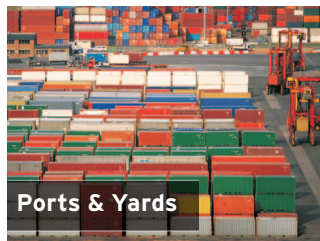
Ports & Yards